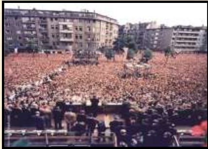
President Kennedy speaking to West Berliners urging the Soviets to tear down the Berlin Wall.

On the evening of Nov. 9, 1989, restrictions between the two Berlins were lifted. Celebrations around the world culminated with Germany being reunified as one country on Oct. 3, 1990.