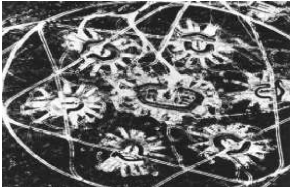
Photographed from an RF-101 Voodoo, this view of a Soviet SA-2 (surface-to-air) missile pattern provided additional evidence of the Russian arming of Cuba.