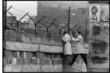
A young woman and her boyfriend talking to the woman's mother, who is on the east side of the Berlin Wall (1962).