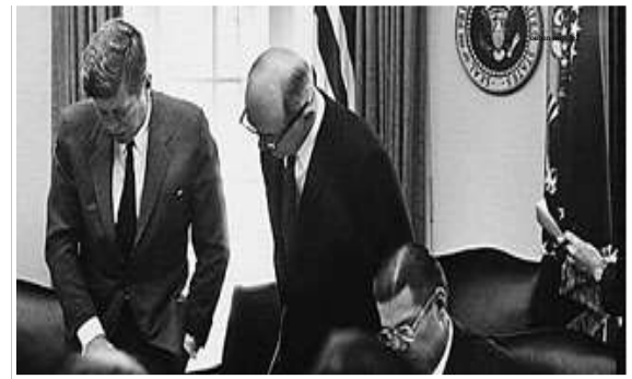
U.S. and Soviets prepared for war... U.S. placed a blockade around Cuba and warned Soviets not to break through the blockade. The Soviets sent their Naval fleet to protect Cuba.