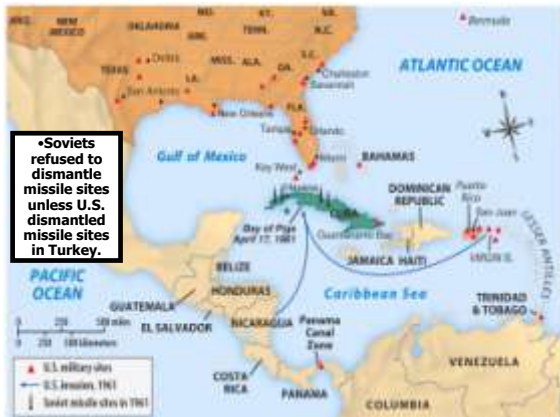
Soviets refused to dismantle missile sites unless U.S. dismantled missile sites in Turkey.