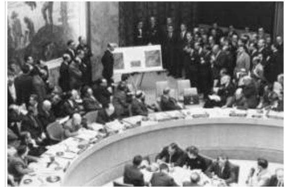
Adlai Stevenson shows aerial photos of Cuban missiles to the United Nations in November 1962.